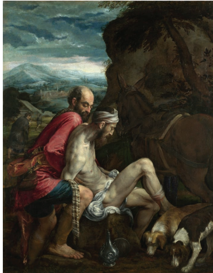
Fig. 1. In the parable of The Good Samaritan [painting by Jacopo Bassano, d. 1592, copyright 2006, The National Gallery, London], Christ preaches universal compassion and prosocial behavior. A similar message is found in many religions. Modern research from social psychology, experimental economics, and anthropology suggests, however, that religious prosociality is extended discriminately and only under specific conditions.

In several behavioral studies, researchers failed to find any reliable association between religiosity and prosocial tendencies. In the classic “Good Samaritan” experiment (22), for example, researchers staged an anonymous situation modeled