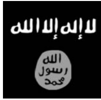
The Banner of al-Uqab: The emblem of the Islamic State of Iraq

Taking the prophet's flag as their own was not the only way in which the jihadists sought to emulate Mohammed. They also adopted his nascent state in Medina as the blueprint for the Islamic State of Iraq. This was a revolutionary step that contrasted sharply with positions taken by other modern Islamists and jihadists, from the Muslim Brotherhood to the first generation of al-Qaeda. These modern movements had cautiously deferred selecting a caliph not only because of their general military and political weakness in the twentieth century, but also to avoid the disputes that had erupted over the ill-defined caliph selection process and other matters in the past. Such disputes had crippled earlier generations of Islamists. But the insurgents' victories in post-2003 Iraq invigorated the jihadist movement with a new sense of strength and unity, and enabled the jihadists to move forward with efforts to resurrect the caliphate.