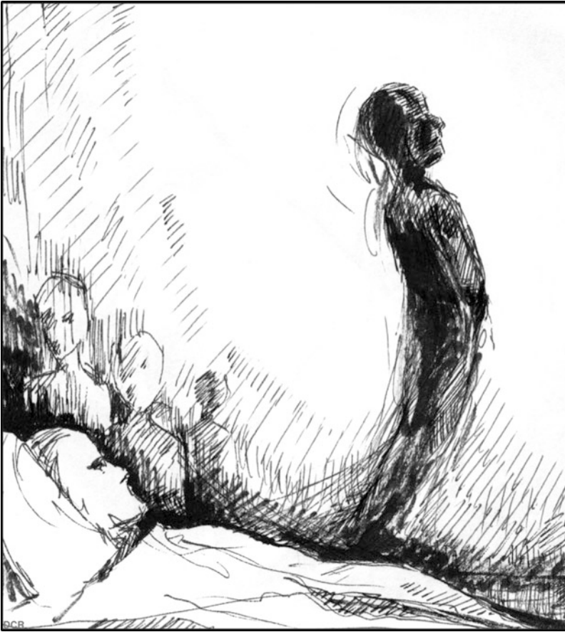
Fig. 1.1 Hallucinations recalled by a patient. Artistic representation of a hallucination reported by a patient after she recovered from a serious disease that produced a near-death experience, in which she felt that her “spirit” was separating from her body

authority or paternal figure, which when occupied provides a sense of confidence and security [4, 5]. Most of us felt secure during our childhood, due to the protection given by our parents. Even later, when we were growing up, we still looked to our parents for guidance. However, when we became too proud to ask for their help, or they could no longer provide this support, we needed to become self-sufficient or get somebody else that would take their place. Perhaps the memory of them or the example they set gives us a sense of confidence and security which is later transferred to a supernatural being that symbolically takes their place. We do not like to be alone and unprotected, but our mere desires are obviously not sufficient to create any god.